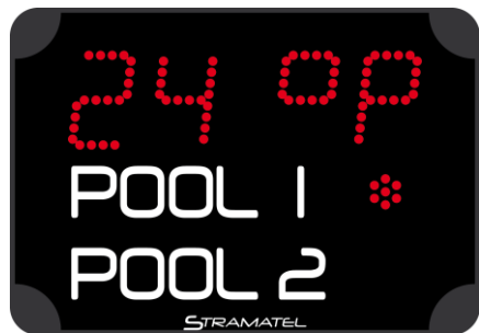
(non contractual picture)

Available in 2 LED colors, red or yellow