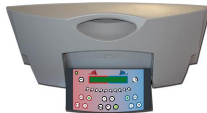
(non contractual picture)