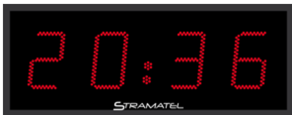
(non contractual picture)